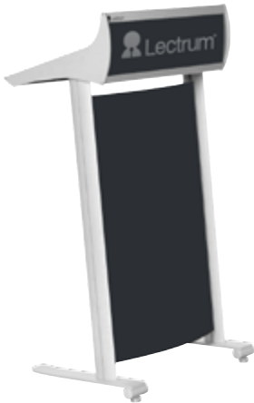
Aero Series Models L2001 & L2001C