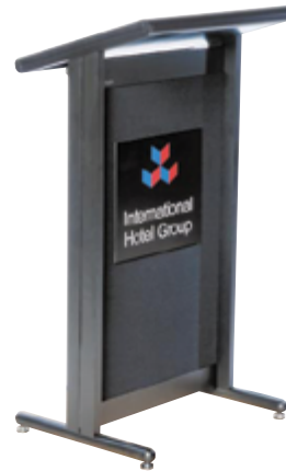
Classic Series Models L20, L20S, LI01 & L900